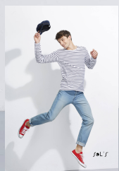
MARINE MEN 01402