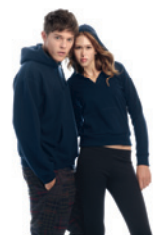
B&C Hooded & B&C Cat /women